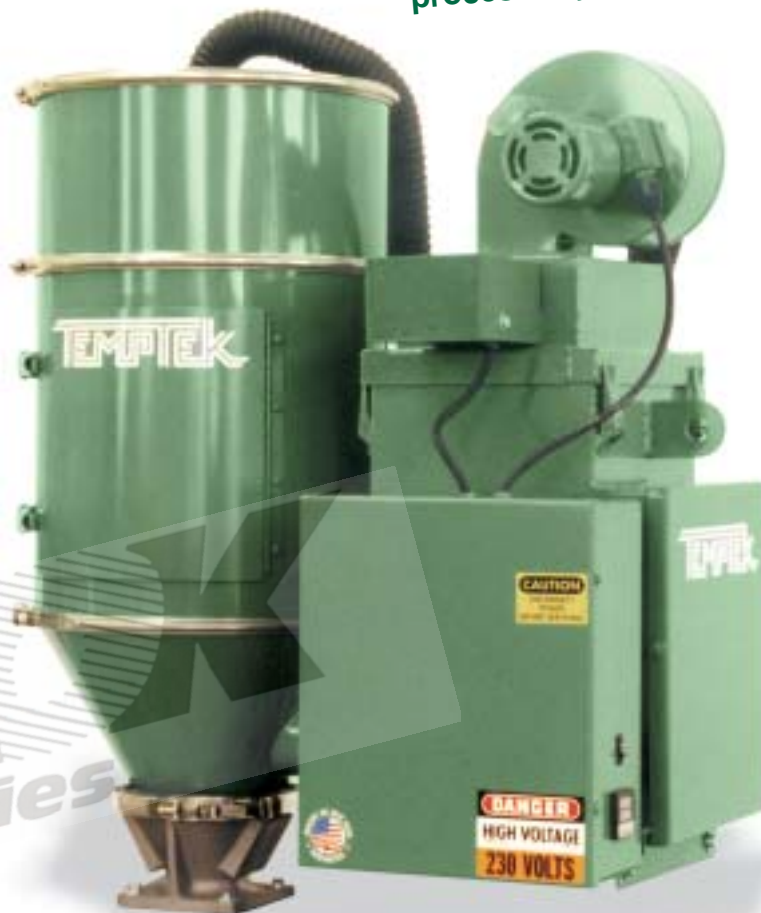
TD-25 model shown with drying hopper and hopper/dryer mounting bracket.