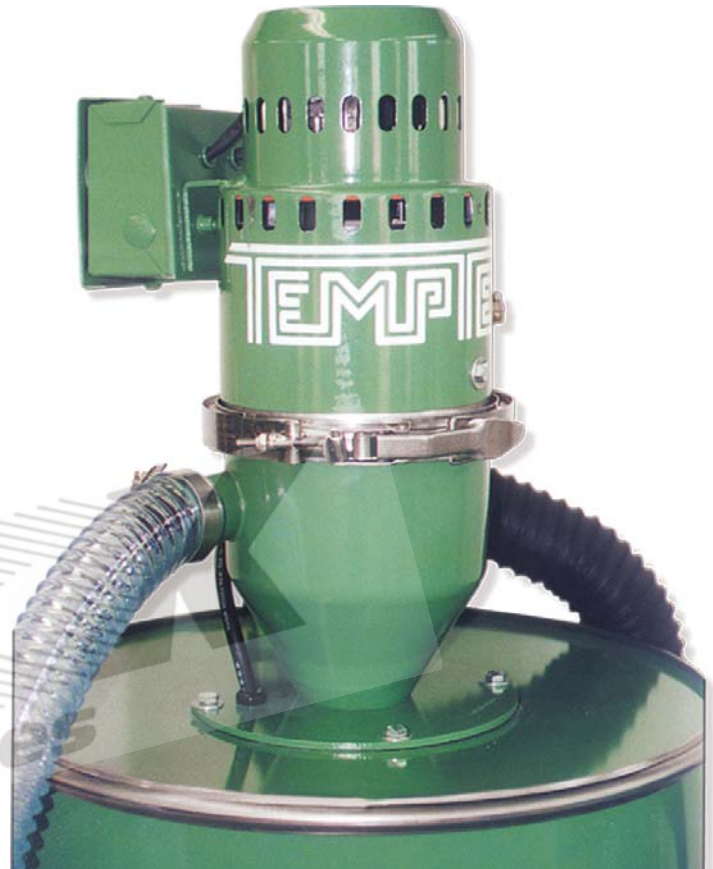
TVL-5 shown mounted on hopper.